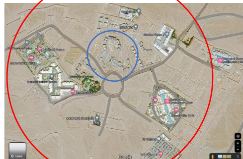
○ Mansions area ○ MEDORA